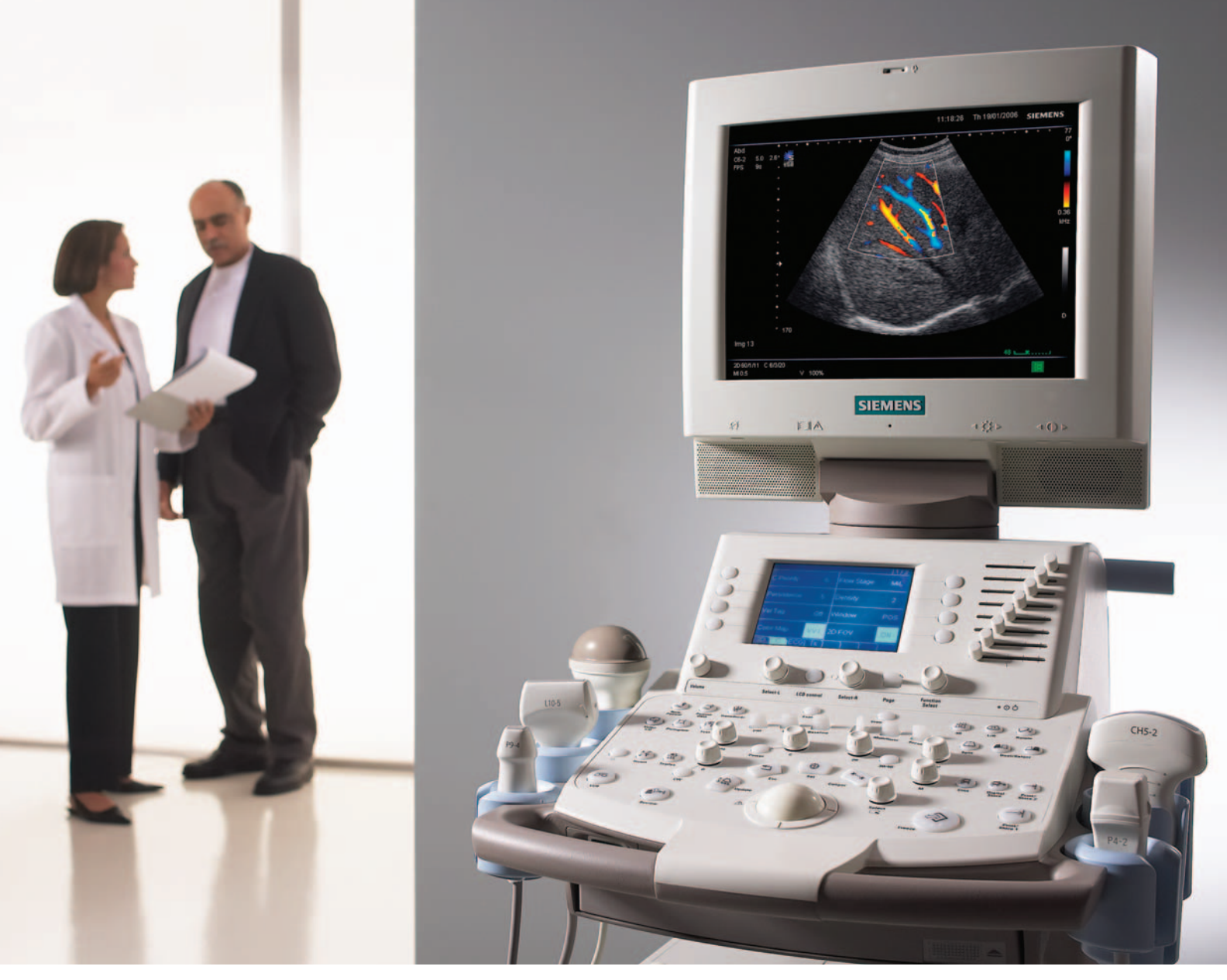
SONOLINE G60 S Ultrasound System Maximized performance for multi-specialty needs