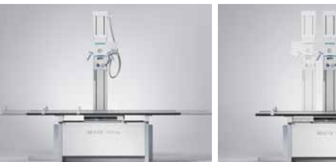
The floating tabletop with a weight capacity of up The synchronized tube and bucky tray movements