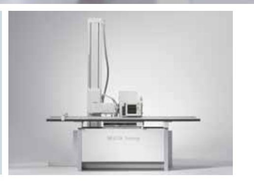
The tube can be rotated for cross-table exposures, expanding the spectrum of clinical applications.