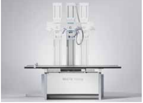
to 450 kg enables easy, comfortable examinations. ensure constant centering of the radiation beam on the cassette. This simplifies system positioning for faster examinations.